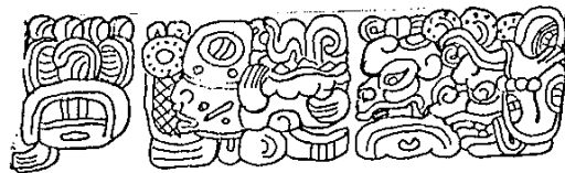
Figure 2 Butz'-Chaan from Stela P